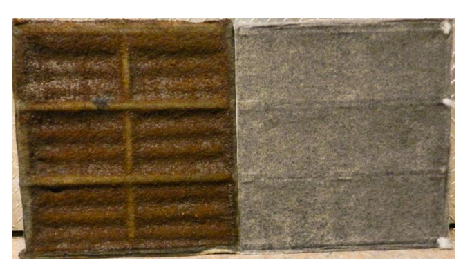
Grease lock filter captures grease before it enters exhaust