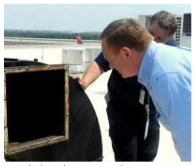
Typical exhaust duct emptying airborne grease