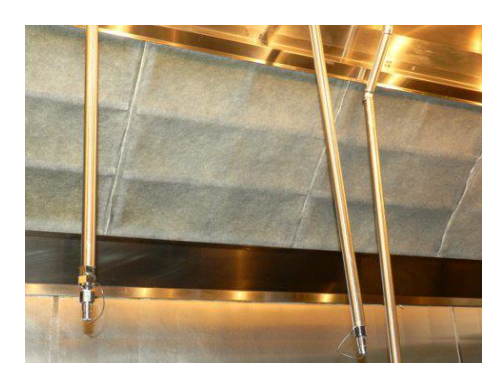
Effective filters keep roof clean