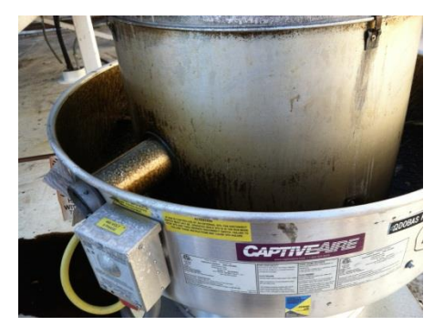
Dysfunctional filters result in grease on roof

Grease Lock Project installed high tech elemental grease filter lowering grease residue and saving over 1 Million gallons of water per year, payback happens in months not years