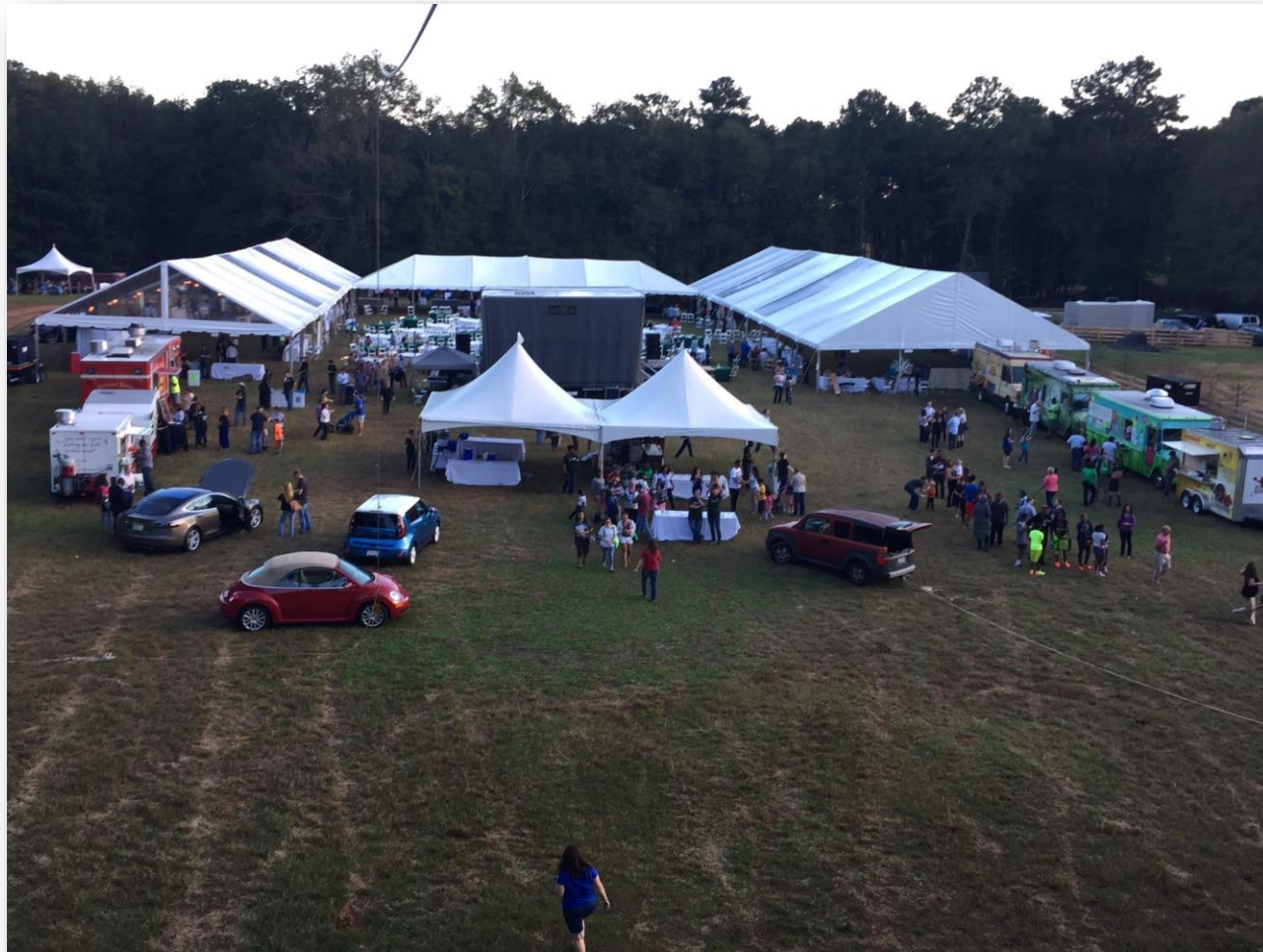
RayDay October 11, 2015