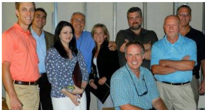
Concord Mills team celebrates the success of their film recycling program.

services, or handling their own waste/recycling contracts. Faced with higher waste hauling charges due to increased plastic film generated by tenants, shopping malls are motivated to capture film for recycling. Additionally, environmentally conscious tenants are vocal to landlords to craft plastic film recycling programs at the malls. With strong support from national non-profits/trade associations and all levels of government, mall management developed successful programs. CM launched their plastic film recycling program in August 2012 and SP followed with their first plastic film bales in the fall. This comparative case study uses plastic film recycling statistics for calendar year 2015.