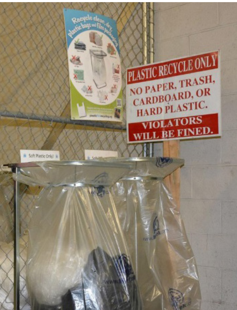
SP stanchion & bag system designed for easy collection by maintenance staff.

Upon program launch in 2012, SP purchased 50 stanchions at $150 each. As of this case study, the original 50 stanchions continue their useful life within the program. Since the stanchion purchase was integrated within the program launch cost, no expense allocation was included in the case study ROI.